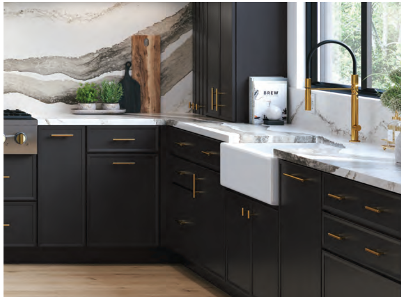
light contemporary >